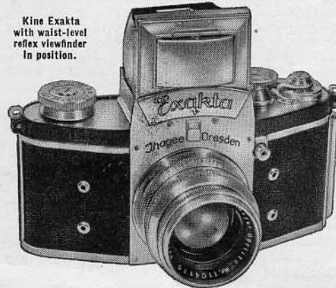
Kine Exakta with waist-level reflex viewfinder in position.

The Kine Exakta "V" serves as two cameras while you buy only one . . . Two built-in, interchangeable viewfinders focus through the lens . . . Reflex Hood and Penta-Prism Eye Level Sport Finder . . . Both shown as illustrated . . . You switch in a jiffy from one to the other!